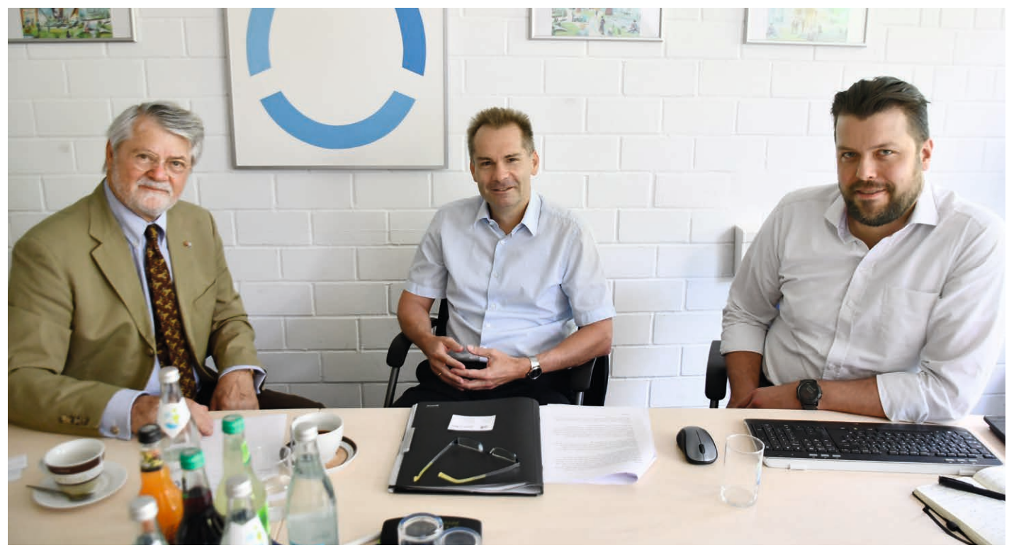
Since 2011 the 90 buses operated by Stadtwerke Augsburg (Augsburg municipal utilities) have been running efficiently, free of malfunctions and climate-neutral with biomethane, while electric buses are not yet suitable for uninterrupted daily service. Today, one electric bus costs between €700,000 and €800,000, about twice the cost of a gas-powered bus. Other factors are the highly complex and costly infrastructure for charging electric buses, explained experts including representatives of Stadtwerke Augsburg in a talk with the Bund der Steuerzahler (Taxpayers Association of Germany). From left to right: Rolf Baron von Hohenhau, President of the Taxpayers Association of Germany of Bavaria, who is also President of the Taxpayers Association of Europe, who pledged full support through the association's policies; Klaus Röder, authorized representative of and fleet manager at Stadtwerke Augsburg, and Daniel Strohschneider, engineer in charge of the bus service workshop at Stadtwerke Augsburg Verkehrs-GmbH.