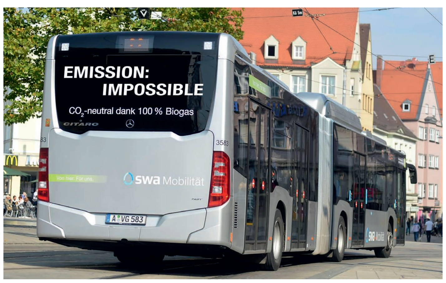
Germany's most environmentally friendly bus fleet. Stadtwerke Augsburg (swa) is the only metropolitan transport company in Germany with 100% biogas buses, CO2-neutral thanks to biomethane. Production exclusively from agricultural residues, organic waste or kitchen waste. No use of food. The Clean Vehicles Directive (CVR) endangers the biogas buses in Augsburg.